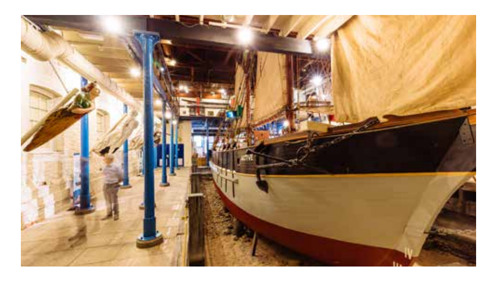
South Australian Maritime Museum, the replica ketch, Active II