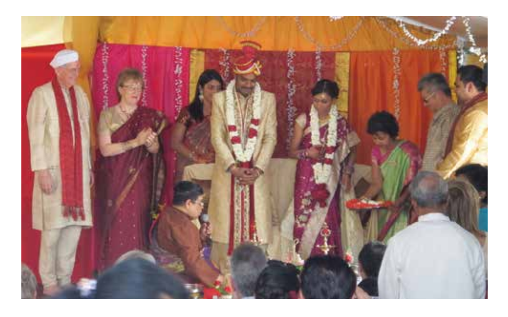
Three Weddings and a Cook event Migration Museum and OzAsia Festival